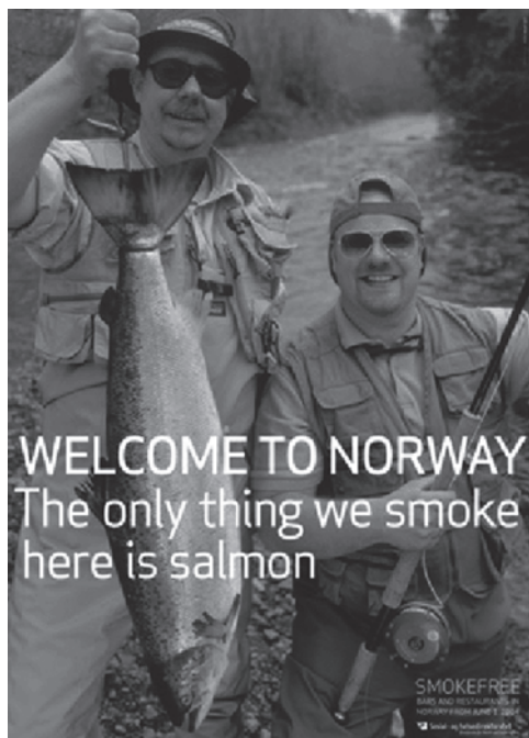
Fig. 5 Norway's tourist promotions highlight its smoke-free policies.