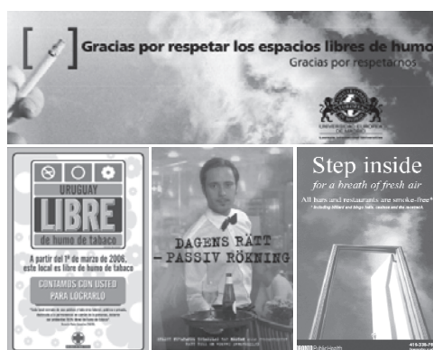
Fig. 2 The universal “No smoking” symbol as well as more novel smoke-free signs from Spain (Madrid), Uruguay, Sweden and Canada (Toronto)

The law should require strong and clear “No smoking” signs that feature the universal symbol (Fig. 2) at every building entrance and throughout smoke-free buildings. These signs are inexpensive and key to effective implementation because they empower non-smokers to urge compliance with the law and inform smokers what areas are smoke-free. The signs should also contain information on how to report violations of the law. These simple signs can be supplemented or combined with more creative educational signs that reinforce the message (Fig. 2).