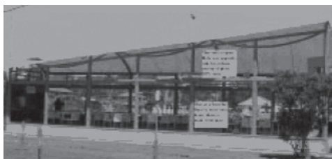
Fig. 1 The “outdoor” addition to a club in New South Wales, Australia where the law currently allows smoking in this type of outdoor area.

Universal effective protection from SHS may therefore require making certain outdoor or quasi-outdoor areas smoke-free, with workers’ health, equity and enforceability being the key