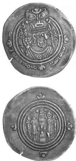
Figure 6: Drachm of ‘Abd al-Malik ibn ‘Abd Allāh, Zubayrid governor of Bishāpūr, 66/685-6 (Shamma Collection 7496, after Album and Goodwin 2002: plate 11.152). Obverse field: typical late Arab-Sasanian bust with name of ‘Abd al-Malik ibn ‘Abd Allāh (in Middle Persian). Obverse margin:—/ bism Allāh / Muḥammad rasūl / Allāh . Reverse field: typical Arab-Sasanian fire-altar with attendants with mint (abbreviation) and date in Middle Persian, i.e. 66/685-6. Reverse margin: pellet at 7h30.

viously borne any religious declaration except the basmala , but the first gold and silver coins struck in Syria by ‘Abd al-Malik, and the first silver issues by his governors in Iraq, all carried one version or other of the shahāda (see Treadwell 1999: 243-45 and table 3; Album and Goodwin 2002: 27-28). It seems highly probable, therefore, that the Marwānids learnt from their opponents to use the coinage in this way (Hoyland 1997: 550-53, 694-95 following Crone and Hinds 1986: 25-26).