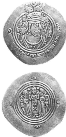
Figure 10: So-called “Caliph Orans” drachm, Baṣra 75AH/694-5CE (Bibliothèque Nationale 1969.75, after Treadwell 1999: 266, B1). Obverse field: typical late Arab-Sasanian bust with the name of Bishr ibn Marwān (in Middle Persian). Obverse margin: legend in quarters 1-3: AN? (in Middle Persian) / bism Allāh Muḥammad / rasūl Allāh . Reverse field: within three beaded circles, three standing figures. The large central figure, flanked by two attendants, has traditionally been identified as the “Caliph orans,” but more probably represents the Marwānid khaṭīb , either the caliph ‘Abd al-Malik or his brother Bishr, delivering the Friday khuṭba with both hands raised. Mint-name and date (in Middle Persian): Baṣra, seventy-five.