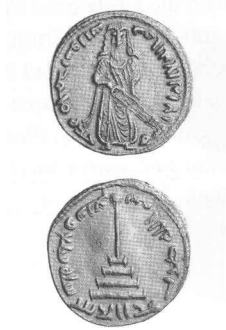
Figure 9: “Standing Caliph” dinar with transformed cross-on-steps reverse, presumably struck at Damascus, and produced each year from 74/693-4 to 77/696-7 (Ashmolean purchase, Peus. 24.3.71, lot. 1029, after Album and Goodwin 2002: plate 45.705). Obverse: normal standing caliph figure, surrounded by bism Allāh lā ilāha illā Allāh waḥdahu Muḥammad rasūl Allāh (“In the name of God, there is no god but God alone, Muḥammad is the messenger of God”). Reverse: transformed cross-on-steps, surrounded by bism Allāh ḍuriba hādḥā l-dīnār sanat sabʿ wa-sabʿīn (“In the name of God, this dinar was struck in the year seventy-seven”).