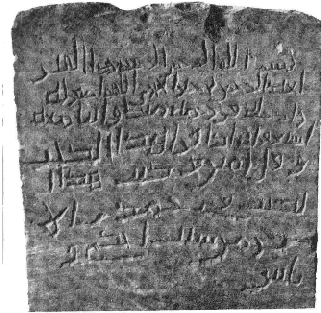
Figure 3: The tombstone of ‘Abd al-Raḥmān ibn Khayr al-Ḥajrī, Egypt, Jumādā II 31 / January-February 652 (after el-Hawary 1930: plate IIIb): bism Allāh al-raḥmān al-raḥīm hādḥā l-qabr / li-‘Abd al-Raḥmān ibn Khayr al-Ḥajrī allāhumma ghfir lahu / wa-dkḥulhu fī raḥma minka wa-ātinā ma‘ahu / istaghfir lahu idhā qurī’a hādḥā l-kit[ā]b / wa-qul āmīn wa-kutiba hādḥā / l-kit[ā]b fī jum[ā]dā l-ā- / khar min sanat idhā wa- / thal[ā]-thīn. “In the name of God the Merciful, the Compassionate. This tomb / belongs to ‘Abd al-Raḥmān ibn Khayr al-Ḥajrī. God forgive him / and admit him to Your mercy, and make us go with him. / Ask pardon for him, when reading this writing, / and say ‘Amen.’ This writing was written / in Jumādā / II in the year one and / thirty.”

date continue to be discovered (Almagro and Jimenez 2000; Walmsley 2003). The earliest palace is perhaps that at Kūfa which is attributed on the weakest of historical grounds to Ziyād b. Abī Sufyān in 50/670, although there is not a shard of archaeological evidence to support that attribution. Kūfa was first excavated seventy years ago, but since then no earlier palace has yet been found. Soon thereafter, throughout Bilād al-Shām, there was a boom in palace construction. Indeed, new examples from the first half of the eighth century of both the urban