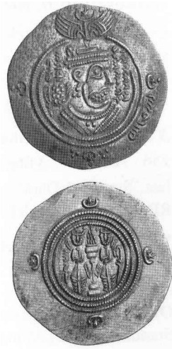
Figure 4: Drachm of Mu‘āwiya, Dārābjird, circa 54-55/674 (Shamma Collection 7481, after Album and Goodwin 2002: plate 17.245). Obverse field: typical late Arab-Sasanian bust with name of Mu‘āwiya amīr al-mu‘minīn (in Middle Persian). Obverse margin: bism Allāh . Reverse field: typical Arab-Sasanian fire-altar with attendants with mint (abbreviation) and date in Middle Persian, i.e. frozen year 43 (circa 54-55/674). Reverse margin: plain.

inscriptions (Fig. 5). 11 (After Mu‘āwiya, the name of the ruler again disappears from these media until ‘Abd al-Malik.) 12 In a recent article, Clive Foss has argued that Mu‘āwiya governed a “highly organized and bureaucratic” realm and that, because “a sophisticated system of administration and taxation employs coinage,” the Arab-Byzantine bronze types with bilingual inscriptions and mint-marks, and a few rare gold coins, all of which were assigned to ‘Abd