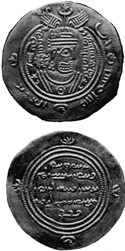
Figure 7: Drachm of ‘Abd al-‘Azīz ibn ‘Abd Allāh, the Zubayrid governor of Sistān, Sijistān, 72/691-2 (after Mochiri 1981: plate I). Obverse field: typical late Arab-Sasanian bust with Middle Persian inscriptions, (left) “May his glory increase,” (right) “‘Abd al-‘Azīz ibn ‘Abd Allāh ibn Āmir.” Obverse margin: –? / bism Allāh / al-‘azīz , “ ? / In the name of God / the glorious. ” Reverse field: Middle Persian inscription on five lines, “Seventy-two / One God, except He / no other god exists / Muḥammad [is] the messenger of God” (cf. Arabic “There is no god but God alone, Muḥammad is the messenger of God”). Reverse margin: plain.

Attention has tended to focus upon the inscription on the inner façade of the octagon, which is principally concerned with defining the position of Jesus within the Islamic scheme. In the context of Marwānid state formation, it is the inscription on the outer façade that is of greater interest. Here, it is the figure